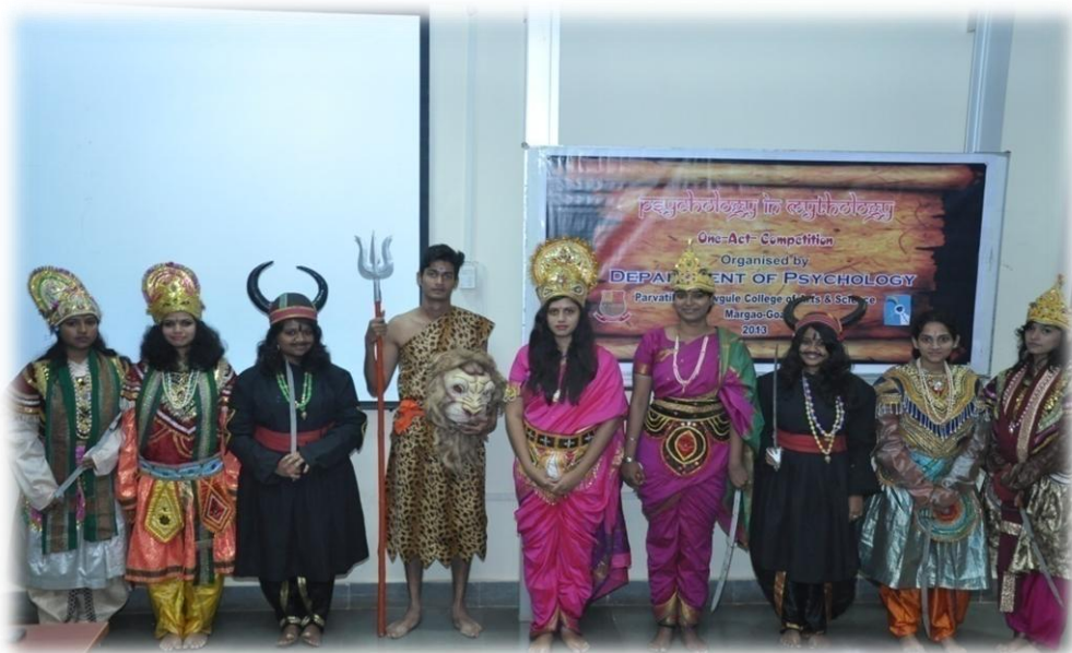
‘Psychology in Mythology’