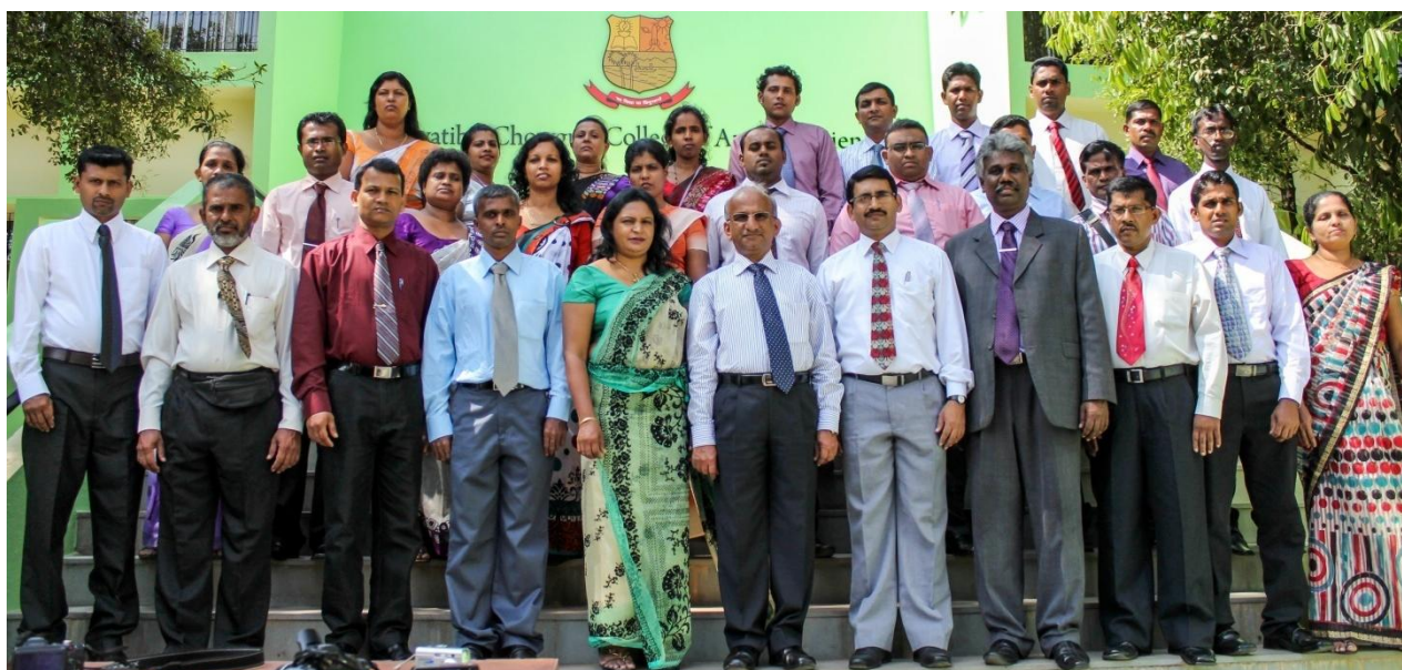
Sri Lanka exchange programme