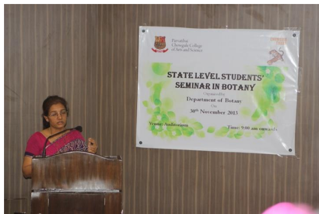
State level Seminar