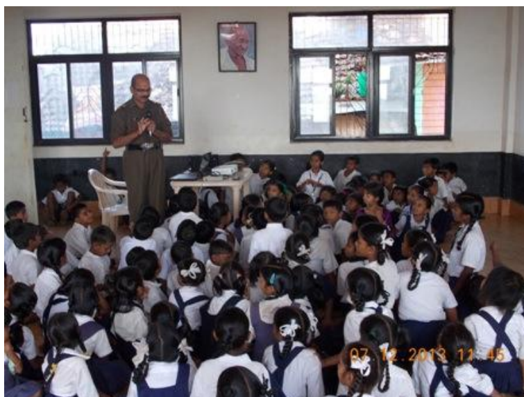
Chalo School Mega Drive

This is an initiative of Butukak Memorial Trust (BMT), Goa, a non profit public charitable trust. This drive was planned for all the high schools from the state of Goa. The college has taken this drive as a community outreach program. This mega drive was organized in association with Collectors of North Goa and South Goa, Department of Education, NSS and NCC units of selected higher secondary and other colleges from Goa. This drive was planned to create awareness amongst the