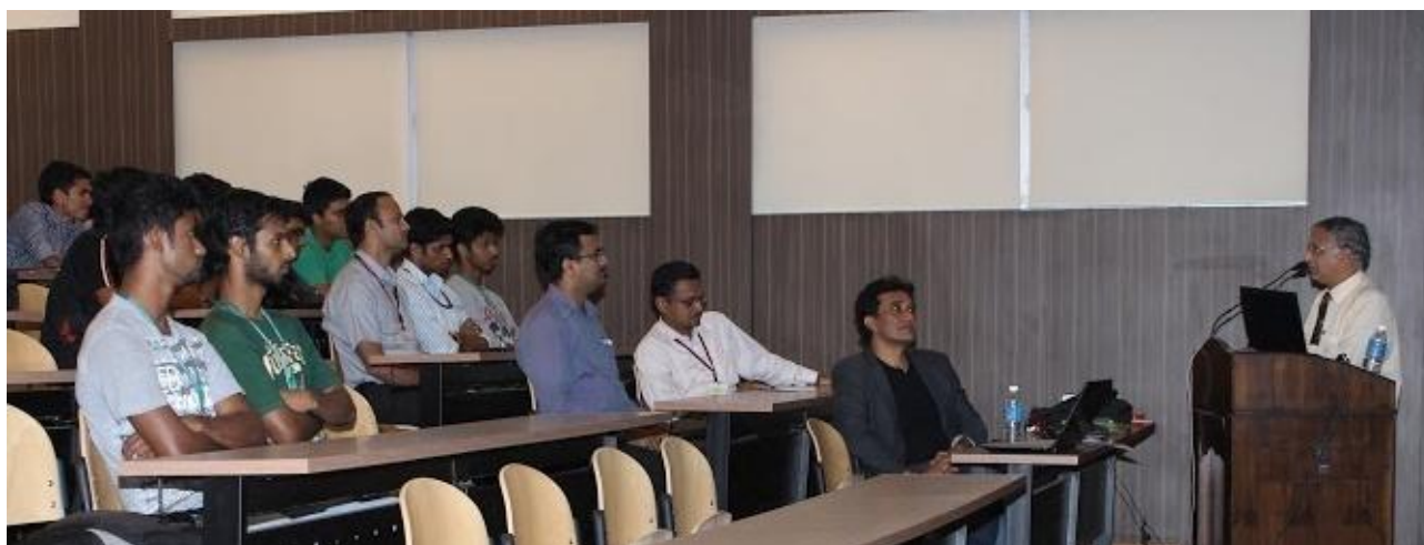
Faculty training programme on "Train the Trainer (TTT)" conducted by D-LINK