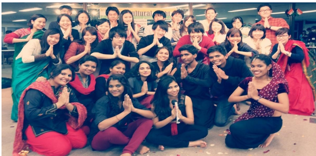
Japan exchange programme